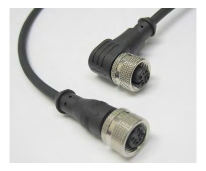
M12, 4C, FEMALE CORDSET